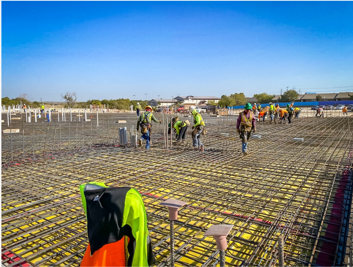
Team of Iron Busters tying rebar together prepping for pour.