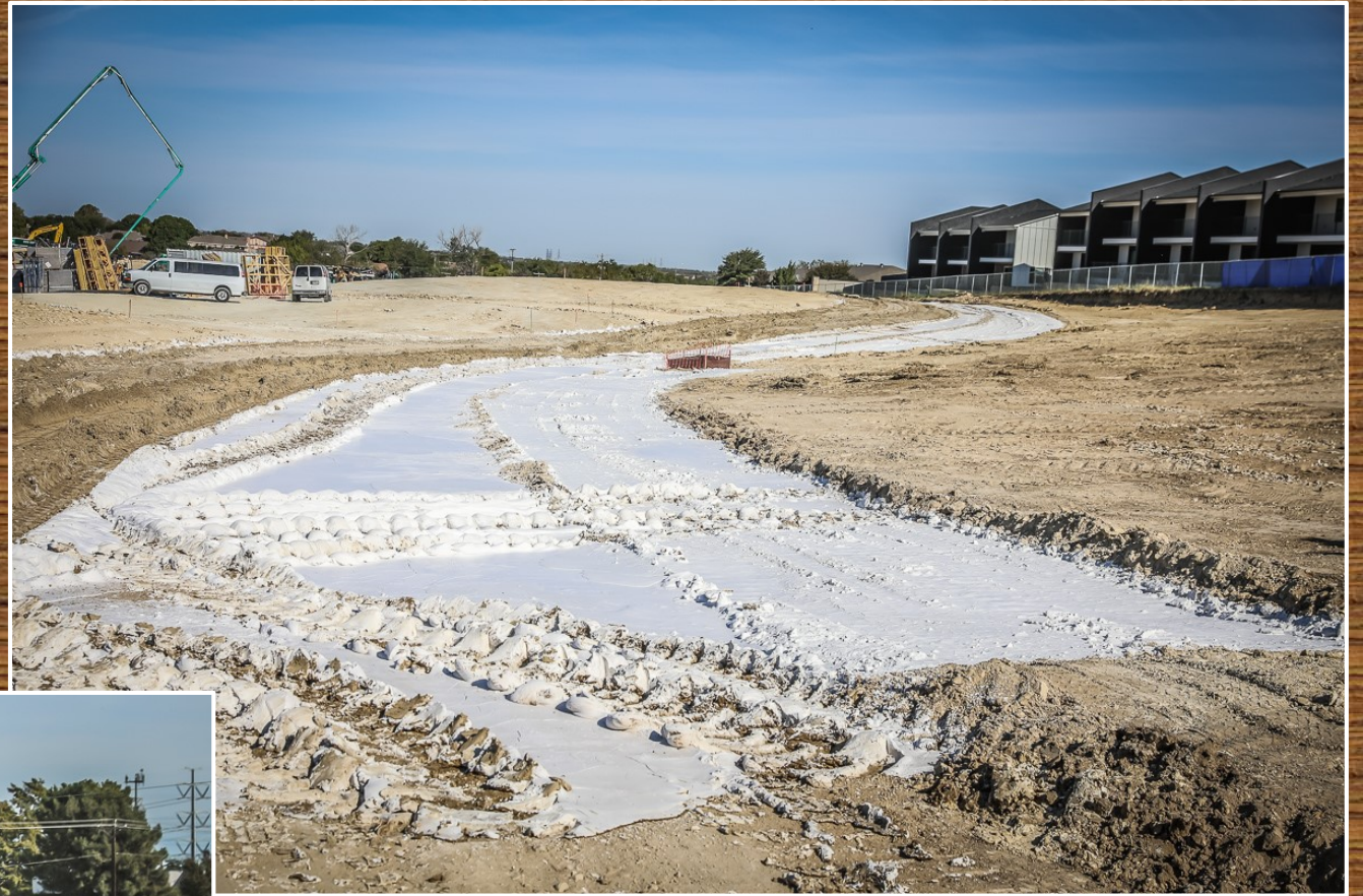
Lime stabilization in progress